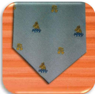
Grey/Silver Tie , Polyester, £12.50