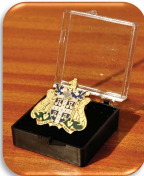
Brooch , enameled image of the Company Arms, £10.00