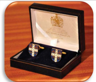
Badge cufflinks , £25.00