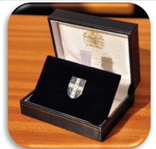
Tie/Lapel badge , of Company crest, £12.50