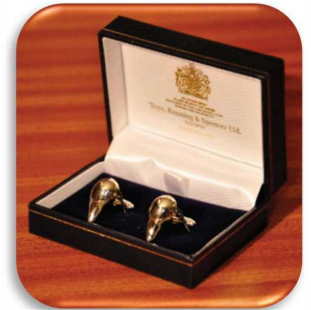
Tear cufflinks , silver with option to gold, £35.00