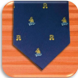
Blue Tie , Polyester, £12.50