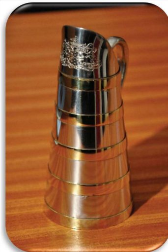
Water Tankards , miniature version of a 400 year old 6 Gallon water tankard in Pewter bearing the Company Arms (height approx. 15cm), £65.00