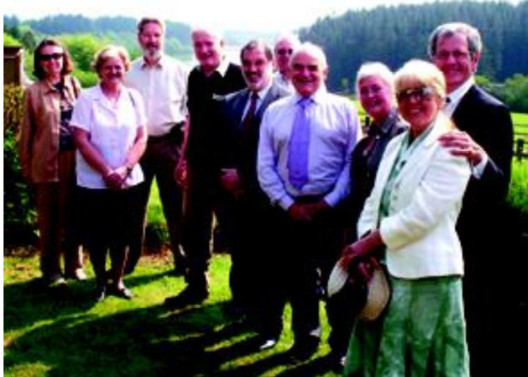
Members at the Calvert Trust