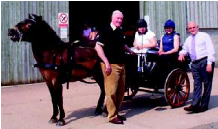
A pony and trap working at the Calvert Trust