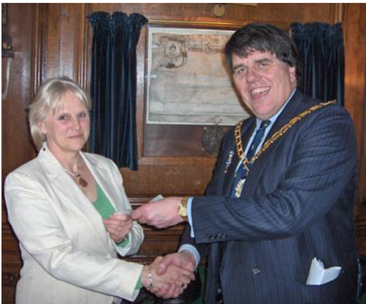
The Master handing over the cheque for the Lord Mayor's charity