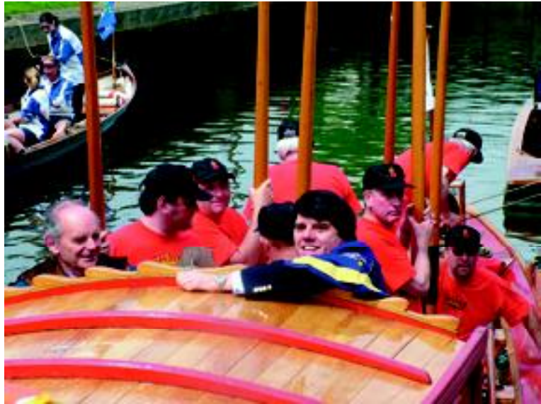
The Master in the Jubilant

It starts at Hampton Court when a piece of elm pipe mounted in a glass case (donated by the Water Conservators) is presented to the Queens Bargemaster. It is then taken on the Royal Barge (the Jubilant). Your Master and his wife jumped on board together with the Master of the Waterman and