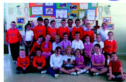
Bursar Primary School