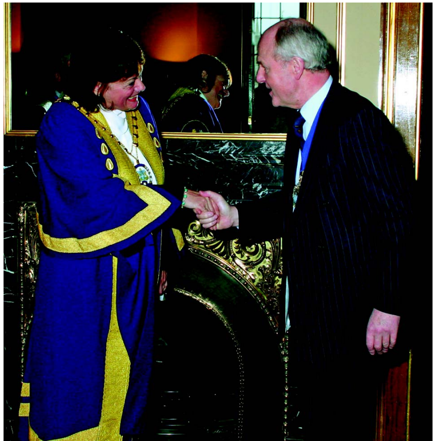
The Master greeting the Lord Mayor