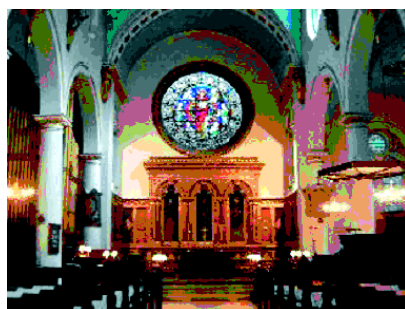
St Micheal's Church

----- The Annual Banquet was a glittering occasion and was held in the prestigious Drapers' Hall on 2 nd November 2006. There were over 150 members and guests. The food and wine complemented the surroundings. The Master welcomed the guests in particular