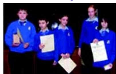
Matthew Humberstone School