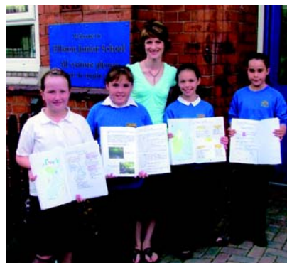
Ellison Junior School