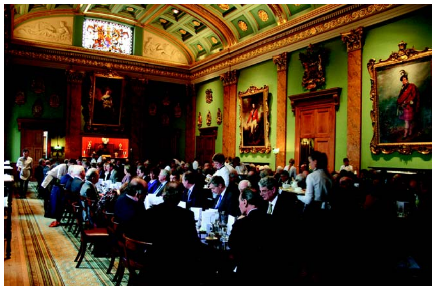
Members and guests at the Myddelton Lunch in Fishmongers' Hall