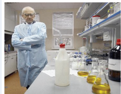
The laboratory of quality and safety of AIC products of the National University of Life and Environmental Sciences near Kiev (Dec 2011).