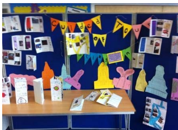
Pupils' Prizes Projects at Hugh Myddelton School.

Recent projects at Hugh Myddelton School, Islington include: the influence of water on the local area around the Clerks Well (Clerkenwell); a study of local water-related architecture and pond ecology.