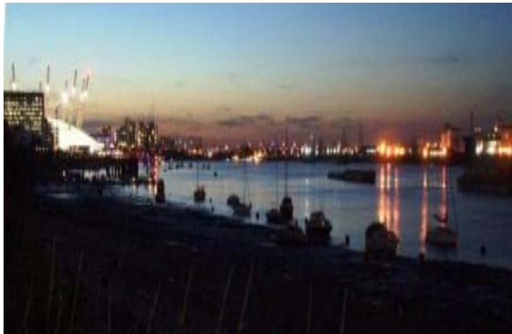
The River Thames from Charlton.