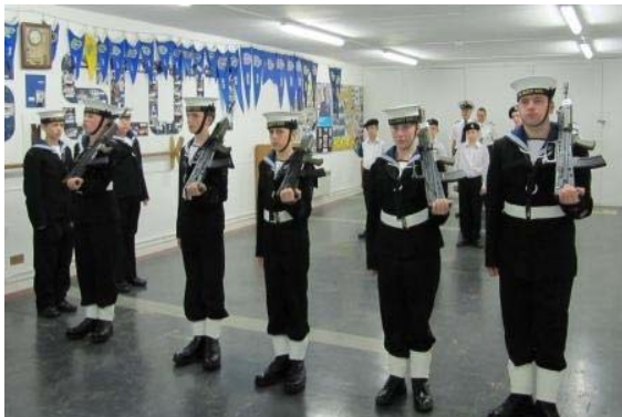
TS Scott: Maidstone Sea Cadets in their recently refurbished crew facilities.