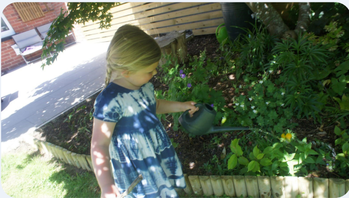
Reece Ward (0 - 10 years) Highly Commended